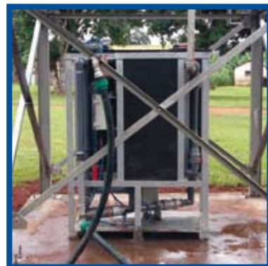
Mono Solar Filtration Unit designed in conjunction with GE.